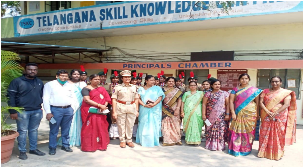
Receiving of guests