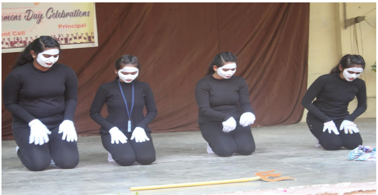
Mime by our students