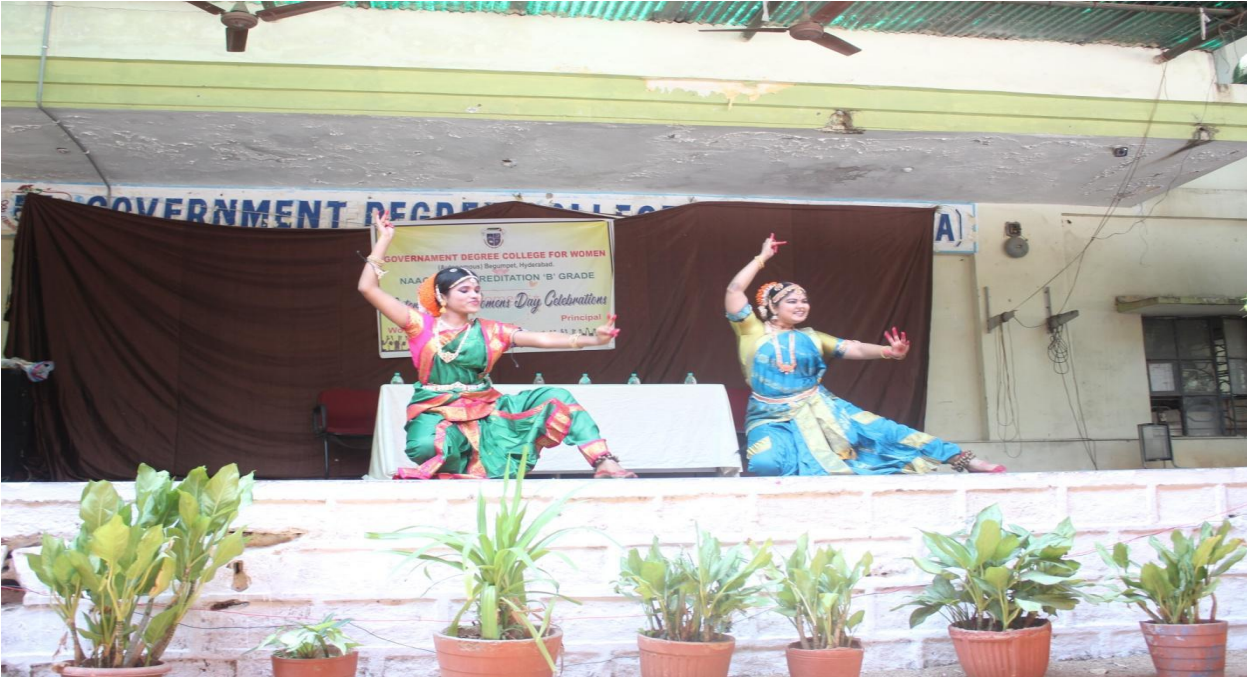
Welcome Dance by our students