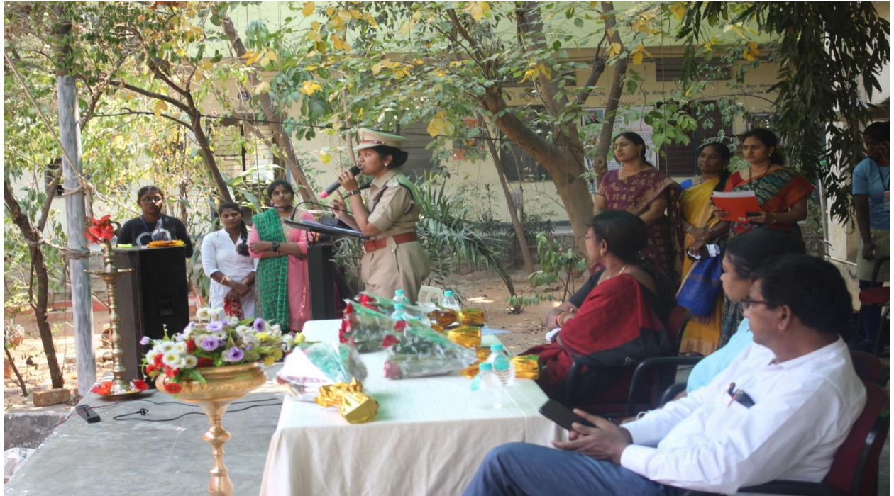
Chief Guest addressing the gathering